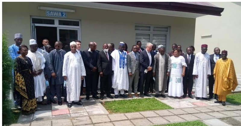
Figure 1: Canyon and Cameroon ministry negotiation teams at the Hotel Sawa, Douala Cameroon, January 2022