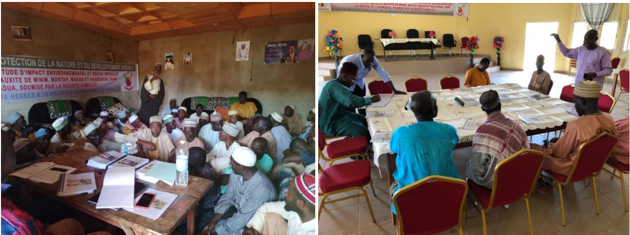
Figures 1&2: Community consultations underway in the towns of Minim and Martap on 25 October 2021

The presentations are an opportunity for people living in the area to ask questions and gain a better understanding of the timing of the commencement of construction of the Project and expected impacts on the local communities.